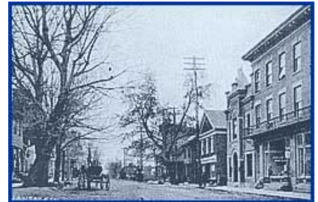
Main Street, Hancock, Maryland - 1906 Many of these buildings are still standing today.

The town of Hancock was once considered on the frontier edge of Maryland, settled in the 1730's.